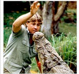
Homo Sapiens, Star of the Wildlife Show