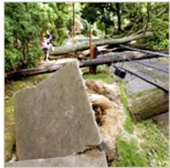
Applebome: Even the Rich Lose Power