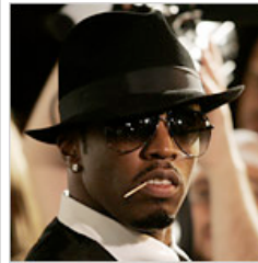
Diddy's New Sound